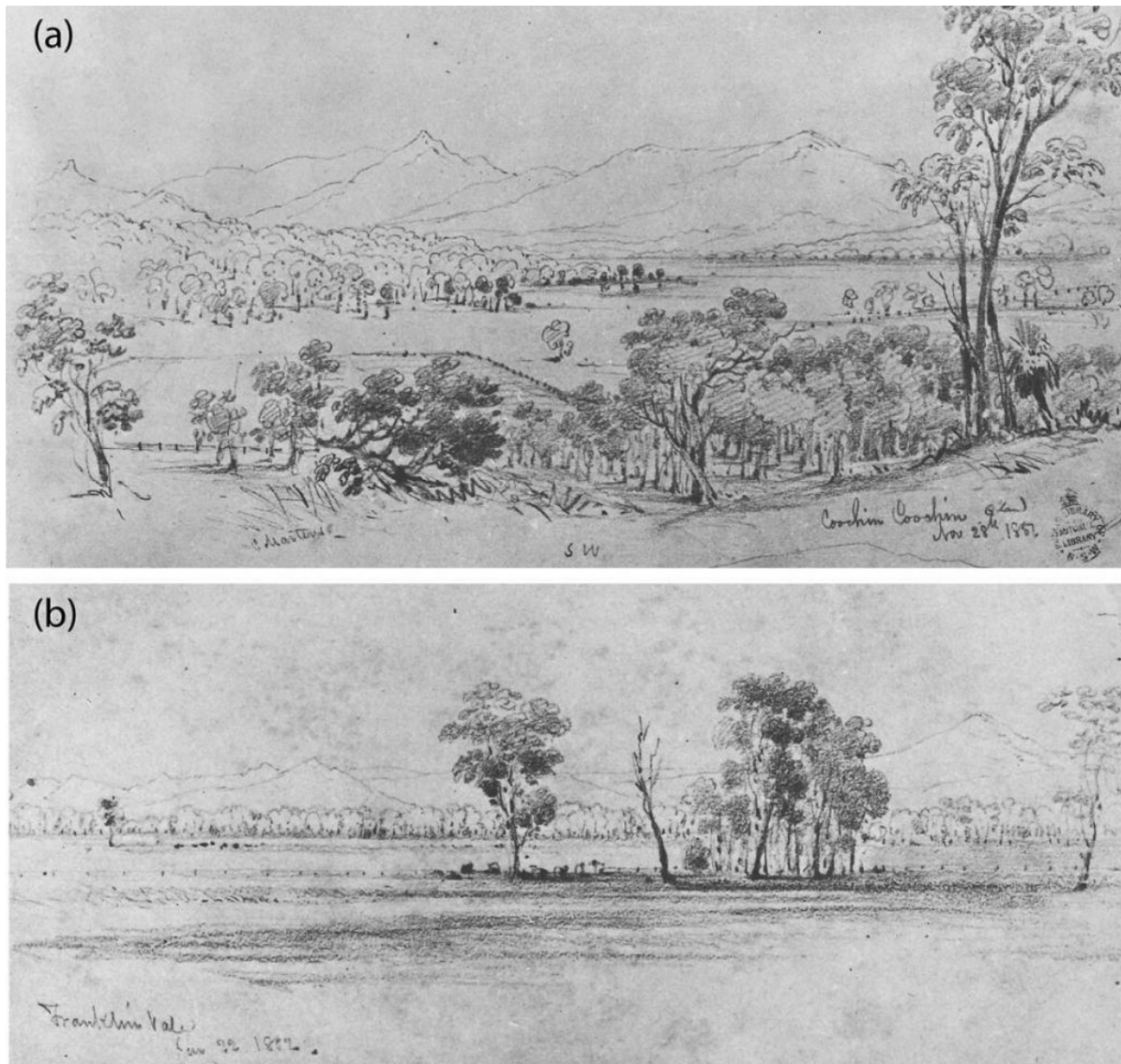
Figure 3. Impressions of the Moreton Bay hinterland in the first decade of European settlement. (a) Coochin Coochin, Qld, 28 Nov. 1851. The view is from the head station of Coochin near Boonah (Fig. 1) with Mount Moon and Mount Alford in the distance. The trees in the foreground follow the path of Teviot Brook (45) (b) Franklin Vale, 22 Jan. 1852. (Photographs courtesy C. Martens, Mitchell Library, Sydney).

These descriptions of open country, grassland or well-grassed open forest, the long-established paradigm of the Australian landscape under Aboriginal management, are easily applied to much of the Moreton Bay hinterland (14, 27, 46, 47). The open country provided easy access for explorers and was rapidly converted to sheep and cattle pastures. There is clear evidence of Aboriginal fire management from the explorer accounts (17), although the frequency of burning is difficult to determine owing to the use of fire as a weapon or deterrent against Europeans (48). In light of the pictorial and documentary evidence, it is strange that quantitative descriptions of vegetation change in south east Queensland are based on 'a once continuous forest cover' (41 p1), where