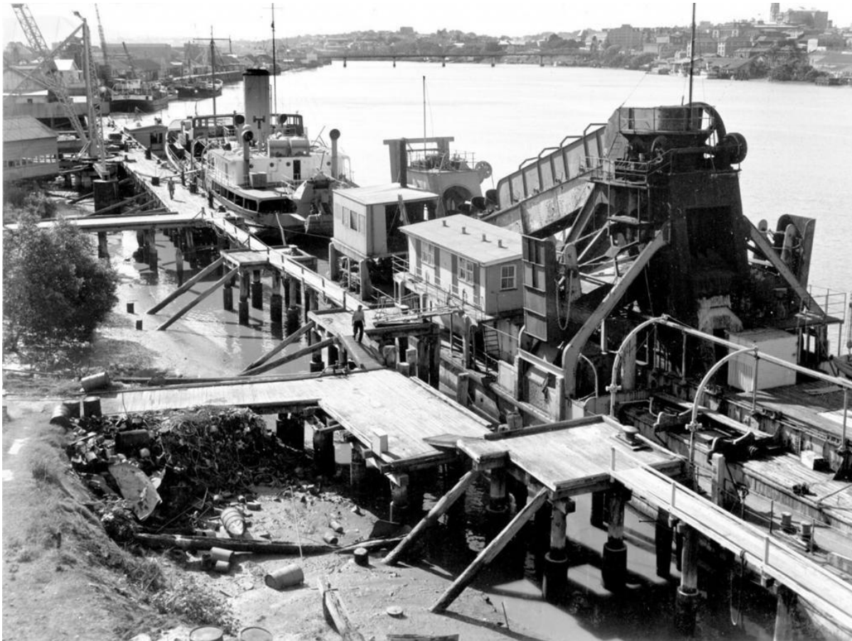
Figure 2. Dredges at South Brisbane coal wharves in 1964

1894 and 1914 (18). Coal was carried from Ipswich to South Brisbane by rail or by river-barge and loaded at the South Brisbane coal wharves (Fig. 2) from the 1870s to the 1970s. These were eventually replaced by a new deep water coal terminal at Fisherman Island in 1983.