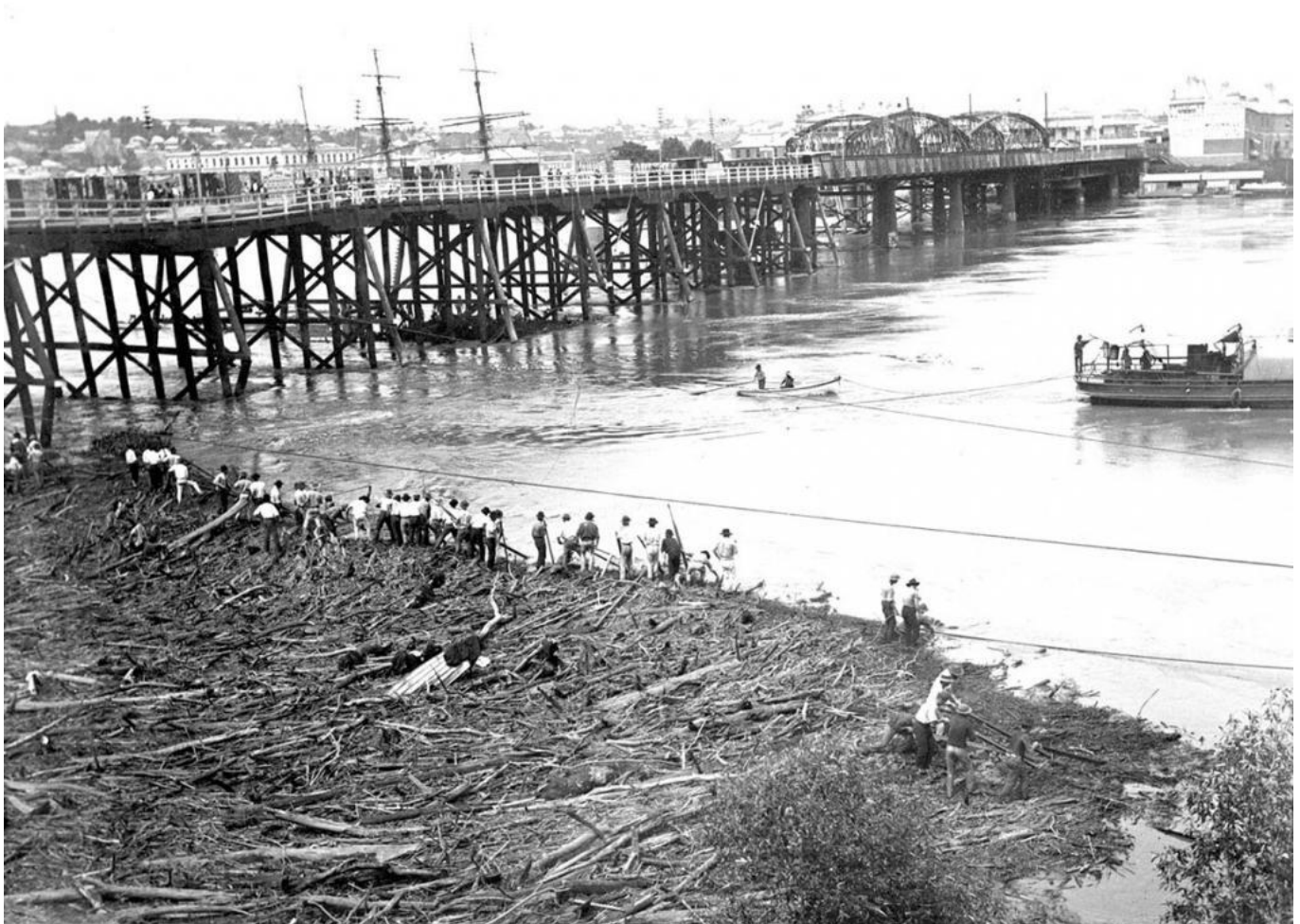
Figure 5. Debris being cleared from the temporary wooden section of the Victoria Bridge in 1896 (From author's private collection).

Constructing cross-river links was an important step in colonial development. These included the first Victoria Bridge (opened for traffic during 1865) and which collapsed owing to poor construction two years later in 1867. A second structure with the same name, opened in 1874, was partly destroyed in the 1893 flood. A temporary wooden bridge was used from 1893 to 1896 (Fig. 5), and a third Victoria Bridge opened in 1897. The first railway bridge at Indooroopilly, constructed in 1875, was also washed away in the 1893 flood. Most bridges over the river were overwhelmed by traffic as well as by floods. For example, in 1886, the Brisbane Town Council asked for the Victoria Bridge to be widened or an additional bridge to be erected 'adjacent thereto', saying: 'It is reasonable to suppose the increase of traffic between North and South Brisbane for the next five years will be equal to that of the last five years' (54).