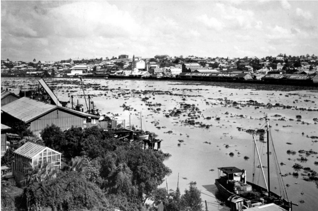
Figure 3. Invasive water hyacinth clumps floating down the Brisbane River 1937 (Reproduced from QSA item 1243115)