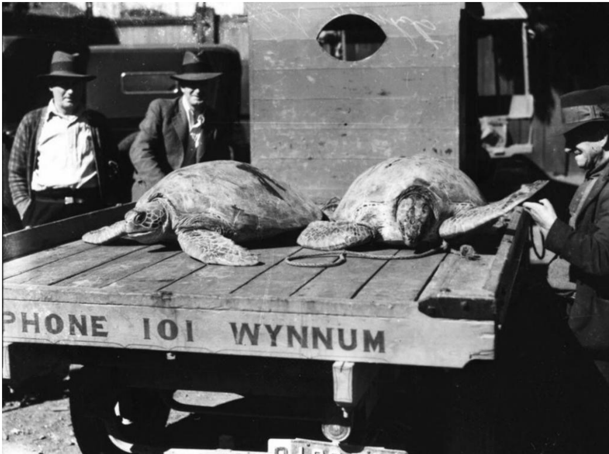
Figure 1. Green turtle ( Chelonia mydas ) harvest in Moreton Bay circa 1934 (49) In recent times, six species of marine turtle from two families have been recorded foraging in the waters of Moreton Bay. Five species of the family Cheloniidae are year-round foraging residents: loggerhead turtle, Caretta caretta , (3); green turtle, Chelonia mydas (4); hawksbill turtle, Eretmochelys imbricate (5); olive ridley turtle, Lepidochelys olivacea (6); flatback turtle, Natator depressus (6). Leatherback turtles ( Dermochelys coriacea ), from the family Dermochelyidae, are migratory visitors (6, 7). Marine turtles within Australian waters are afforded protected under the Australian Government's Environment Protection and Biodiversity Conservation Act 1999 (EPBC Act) and by state and territory legislations. Two species (green and loggerhead) migrate into the Moreton Bay waters and nest annually at low density on the ocean beaches of the Bay islands (6). Small post-hatchling loggerhead and green turtles travelling south with the East Australian Current from the nesting beaches of the southern Great Barrier Reef (GBR) region pass through the waters offshore Moreton Bay on their way south and east into the South Pacific Ocean (8). This review does not address biological data associated with debilitated or dead marine turtles that have washed in from the pelagic waters of the Coral or Tasman seas.

Immature marine turtles recruit from a pelagic foraging life-history phase in the open ocean to benthic foraging in coastal waters at different sizes: loggerhead turtles recruit to benthic feeding in Moreton Bay at a mean curved carapace length (CCL) of 78.2 cm