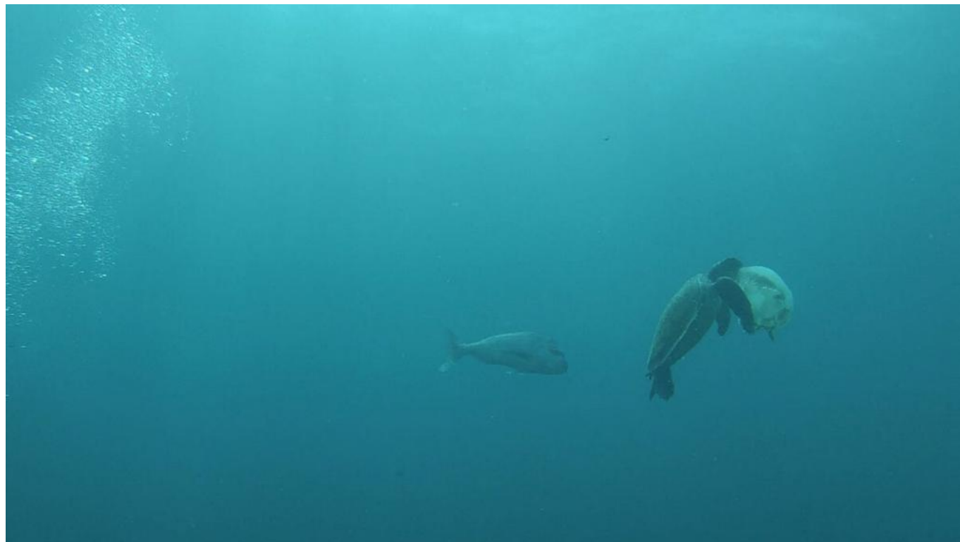
Figure 3. Neritic-foraging immature green turtle prey on jellyfish, northern NSW.

Hypnea sp.) and seagrass ( Zostera capricorni and Halophila ovalis ) and opportunistically on mangrove ( Avicennia marina ) leaves and propagules (Table 1). At higher trophic levels, observations of opportunistic foraging on gelatinous animal material in Moreton Bay (27–29) are consistent with findings from other foraging populations (Fig. 3) (30–33).