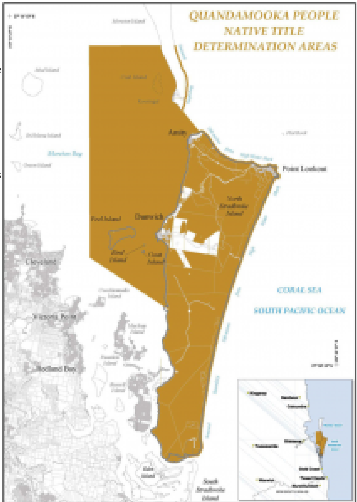
Figure 2. Quandamooka People Native Title Determination Areas

including access and travelling across the area and they have the right to take Traditional Natural Resources for non-commercial, personal or communal purposes. These rights are recognised subject to State and Commonwealth laws and are subject to the law and customs of the