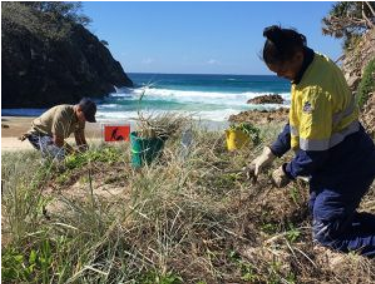
Figure 7. Quandamooka Rangers prepare vegetation for frontal dune rehabilitation at South Gorge, Point Lookout following filming of the blockbuster Warner Brothers film, Aquaman.

At the peak of the filming QYAC provided a cultural briefing and Welcome to Country for all film participants whilst Elders were introduced to the site and crews to observe activities. Cultural Heritage Monitors and Rangers ensured Quandamooka protocols were followed and