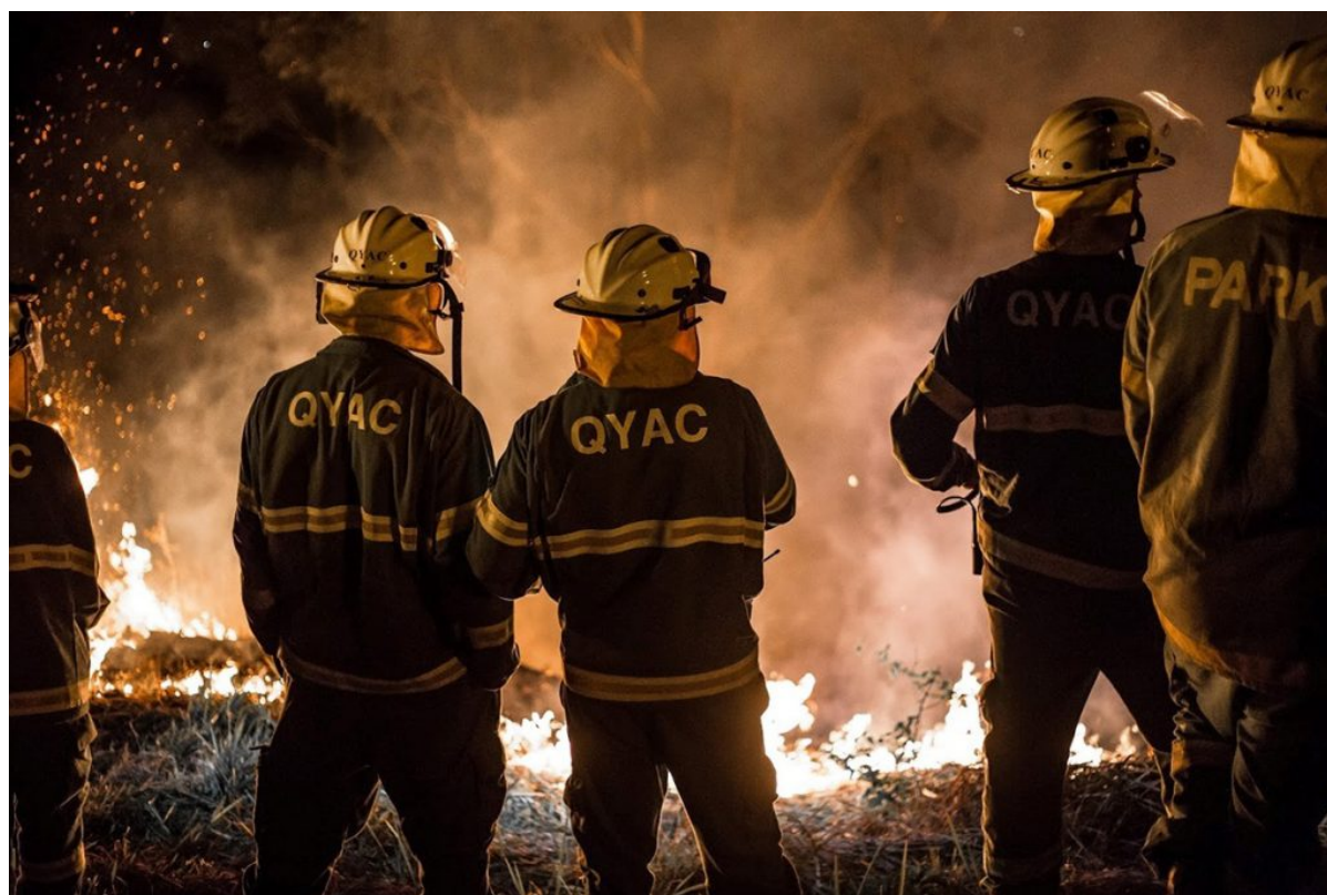
Figure 5. QYAC Rangers undertaking regular controlled burn activities at night to make use of optimal climatic conditions.

and the QPWS. This has been complemented by an expansion of rural firefighters trained in wildfire response to assist local QFES crews, Redland City Council responders and staff employed by mining company Sibelco. QYAC has worked to source resources to ensure Ranger units are well equipped with firefighting equipment. The ranger team now includes a fleet of four-wheel-drives fitted out with fire units to emergency services standards; All Terrain Vehicles equipped with tanks and hoses to enable access to some of Minjerribah’s most difficult to reach landscapes; and heavy equipment including tractors, loaders, and mulching machinery to enable tracks to be prepared and fire breaks to be cut.