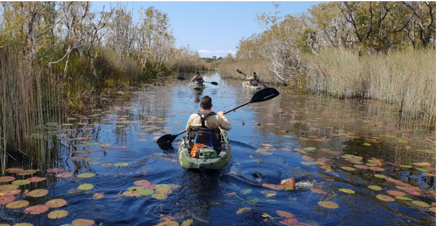
Figure 4. Caring for Quandamooka Country - QYAC Rangers traverse many remote locations (e.g. 18 Mile Swamp).

Given the current suite of management challenges and threats to Moreton Bay and its critical importance to the Quandamooka People, the broader community, and to various levels of government it is vital that the Quandamooka Ranger Program be strongly supported. This highly cost-effective program needs to be able to contribute and collaborate in future research initiatives, as well as continuing to complete the large workloads on which they currently are required to deliver.