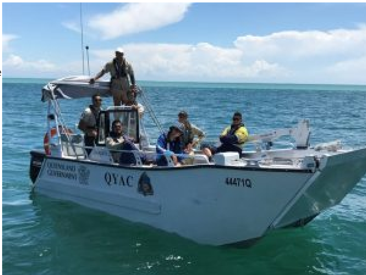
Figure 6. QYAC Sea Rangers in Moreton Bay: growing young Quandamooka People to be the future leaders in caring for country (Source: QYAC ).

This approach to increased involvement of Quandamooka Rangers in the management and monitoring of Sea Country has seen Quandamooka People strengthen skills in undertaking seagrass assessments, coral reef monitoring, improve understanding of dugong & turtle population