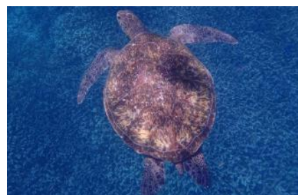
Endangered Green turtle (Chelonia mydas) in Moreton Bay

Although Green turtles show a recent increase in numbers in Moreton Bay, most turtle species in the Bay are in decline or poorly understood. Most threats, such as plastic ingestion, coastal development and sedimentation, exposure to toxic pollutants, sea level rise, and temperature increase, are likely to worsen in the decades ahead - including in Moreton Bay. Hence, the 'Condition trend' for sea turtles is rated as 'Declining' with 'High' confidence. There is also a substantial risk to the condition trend for Moreton Bay turtles from sedimentation and toxic pollutant impacts. This is due to (i) the large-scale coastal development surrounding the Bay and turtles' dependence on benthic communities for food. These impacts were evidenced after the 2011, 2012 and 2021/22 floods, which led to large sediment load inputs, followed by substantial seagrass loss and major impacts on the epifaunal and infaunal communities on which sea turtle species rely. Hence, the contribution of sedimentation to this condition trend is likely to be 'Moderate' within the Bay, diluted to an extent by the broader suite of other significant impacting factors.